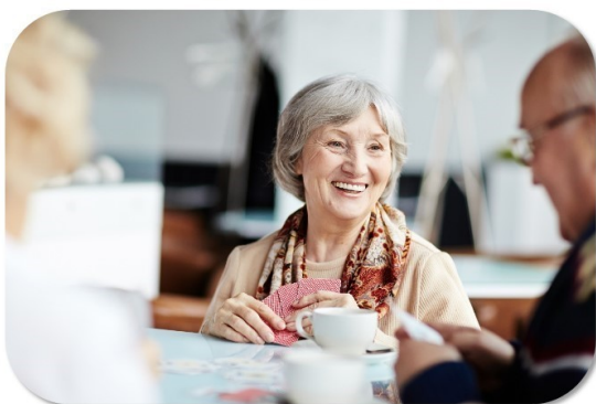
Table Games & Coffee

Thursday afternoons (1 – 3 pm, until June) at Hamptons' Schools