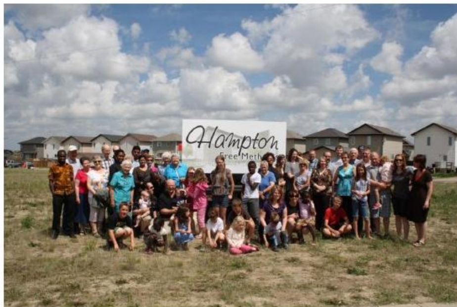
Hampton Free Methodist- A Welcoming and Caring Community Church