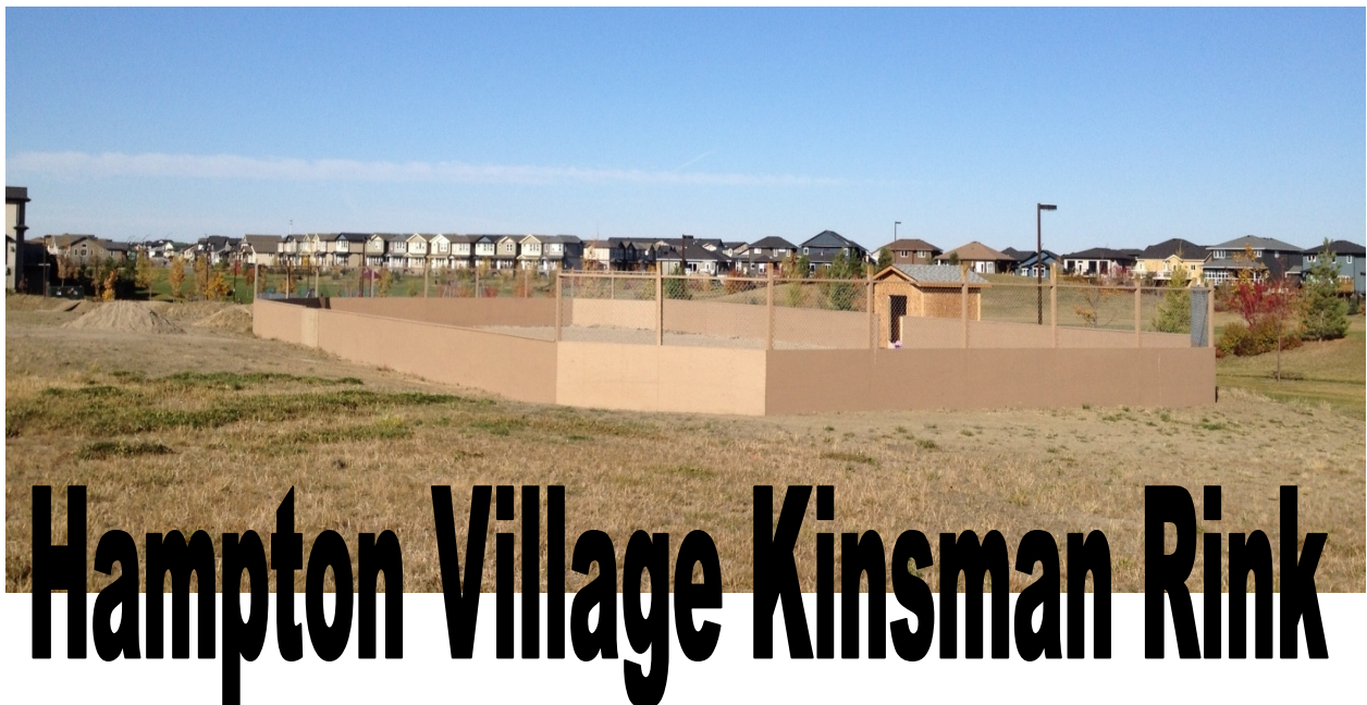
Hampton Village Kinsman Rink

For every person that attends the AGM, HVCA will donate $10 to Kidsport. There will be pizza & coffee at available.